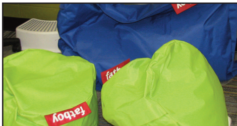
More seating styles: soft, super-lightweight bean bags accommodate all sizes of students and are easily moved around the room.