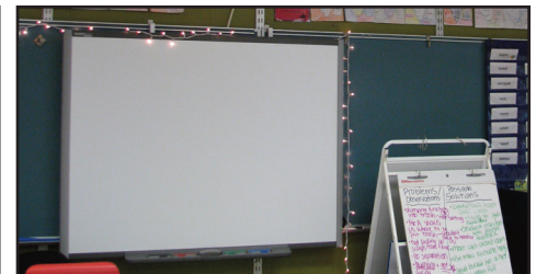
Sleek ceiling-mounted projector connects to the SMART Board; students enjoy leading lessons using the interactive touch-screen.