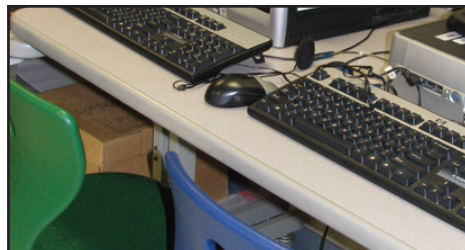
Desktop computers augment the portable devices. Students access Web-based tools for learning from desktop or portable devices.