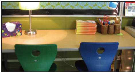
A variety of learning areas, such as this cozy corner for two, suit quiet, active, group and individual learning.

eight classrooms into 21st Century model classrooms to support our focus on the D41 Learner Characteristics and lively, interactive learning. We’ve learned from this project and plan to add more 21st Century classrooms next year.