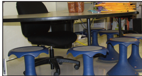
Ergonomic stools allow students to perch and rock a bit in comfort.