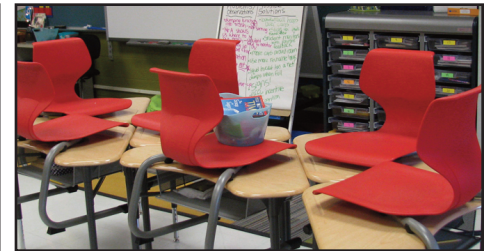
Lightweight chairs lift easily onto the desk-top at the end of the day in preparation for the custodian.