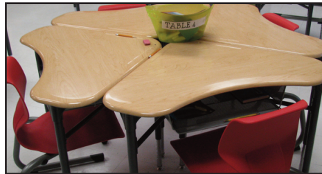
Desks are easily grouped and regrouped for collaborative work.